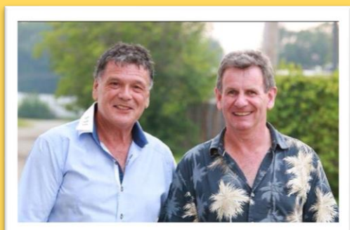
The New Barleycorn